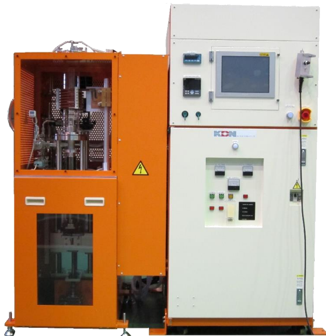
Fig.1: Photograph of Micropuller O-01